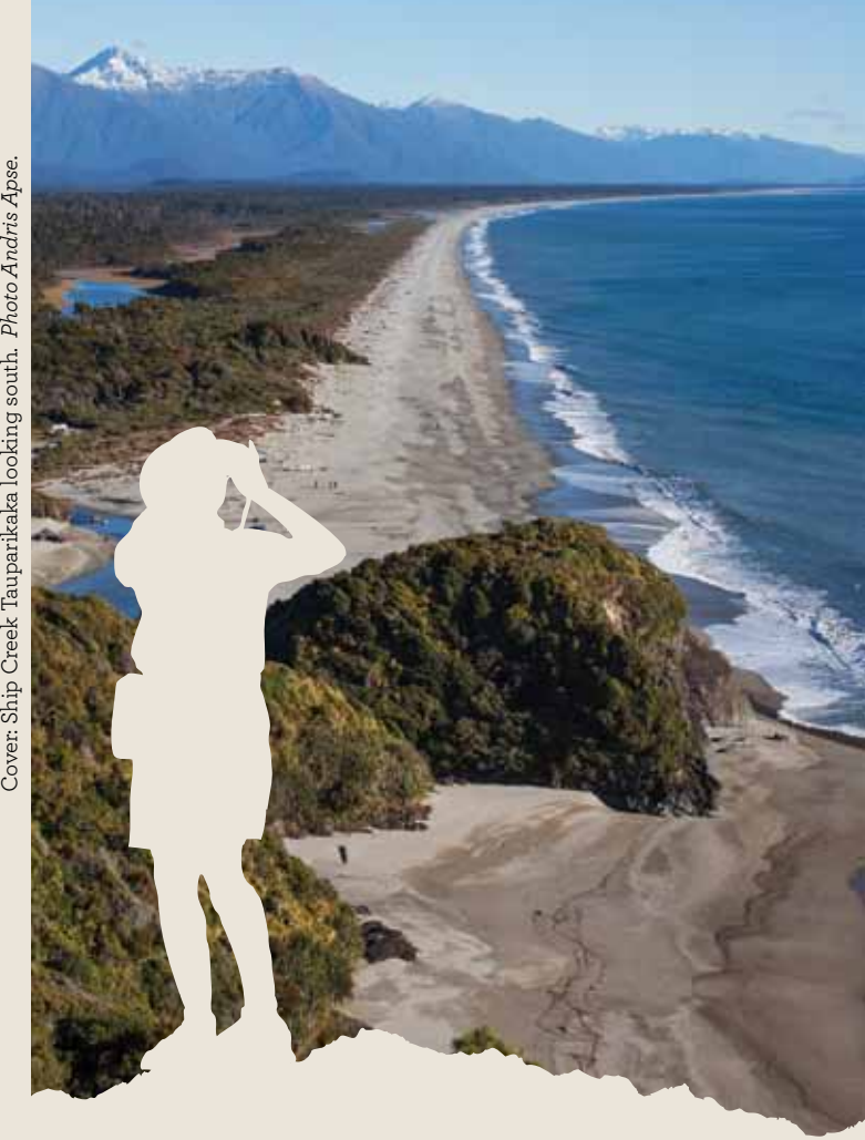
Department of Conservation Te Papa Atawbai